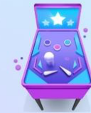
PINBALL HEROES TECHNICAL