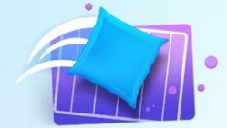
GOING THE DISTANCE ENGINEERING