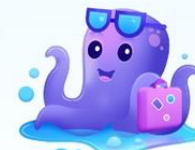
MAKING A SPLASH EARLY LEARNING