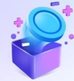
SO EXTRA IMPROVISATIONAL