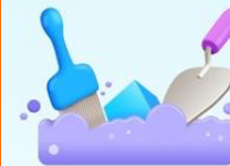
BLAST FROM THE PAST SCIENTIFIC