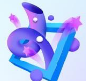
IN MOTION FINE ARTS